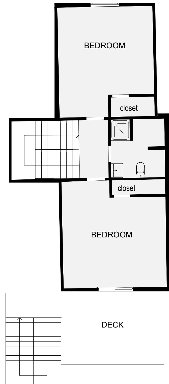
ATTIC FLOOR PLAN